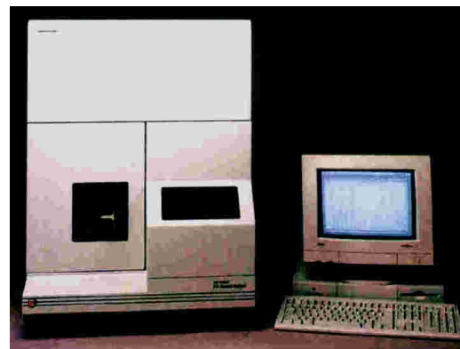
Photo 5. Genetic analyzer