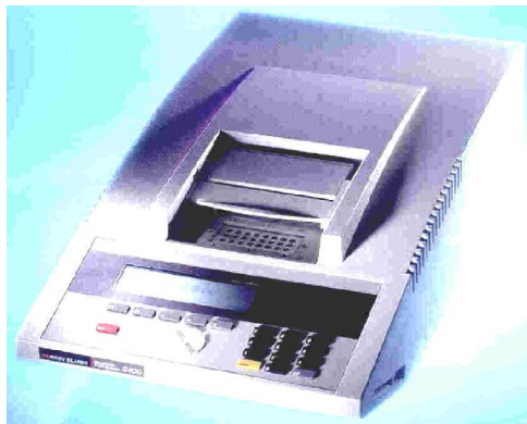
Photo 4. PCR system