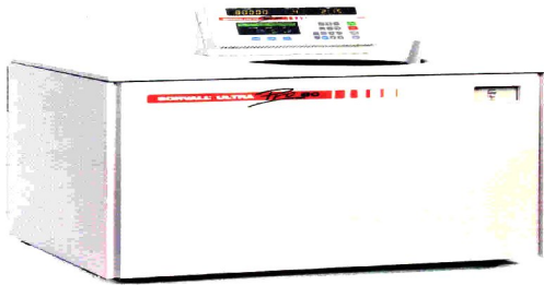
Photo 1. Ultracentrifuge