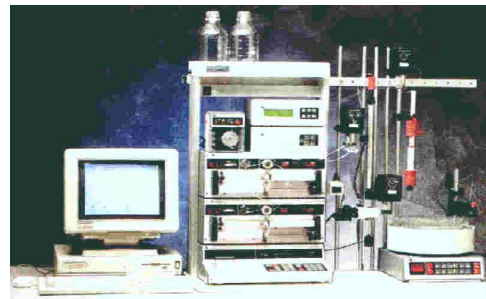
Photo 4. FPLC