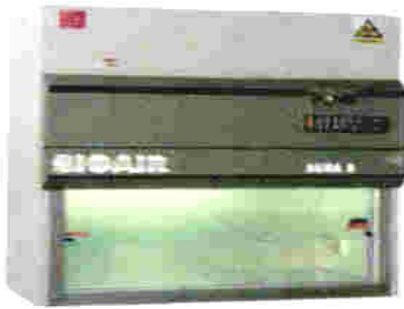
Photo 3. Laminary flow hood